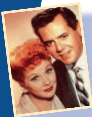
Lucille Ball and Desi Arnaz

Although regular television broadcasts had begun in the early 1940s, there were few stations, and sets were expensive. By the end of the 1950s, however, the small, black-and-white-screened sets sat in living rooms across the country. Television's popularity