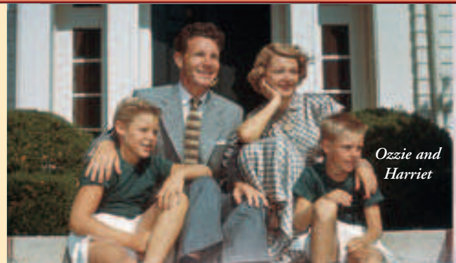
Ozzie and Harriet

Westerns were also popular at the time, especially The Lone Ranger , in which a mysterious masked man helped people in distress. The Howdy Doody Show , which featured Buffalo Bob and his freckle-faced marionette, was the first network kids’ show to run five days a week, the first television show ever broadcast in color, and the first show ever to air more than 1,000 continuous episodes.